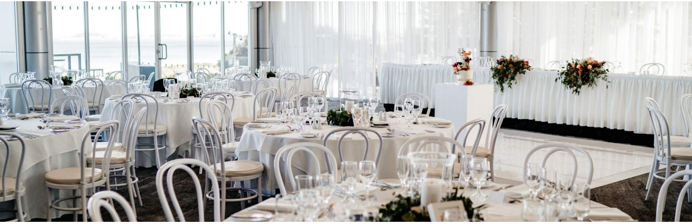
Four hour room hire including the use of your own private balcony with beach views

Based on min of 80 adults in the Ocean Room and 110 in Pearl Room